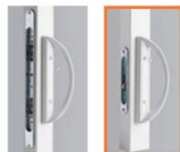
Double-Pointed Lock /White