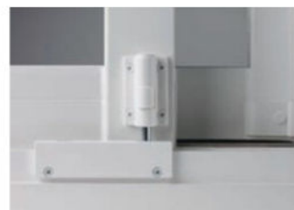
Kick Lock/Foot Lock