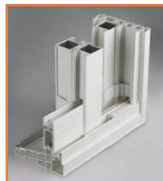
Corner cross section

It's our first, middle, and last name. Some of the most skilled and experienced craftsmen make our products with overwhelming pride. They ensure that you receive... All multi-chamber vinyl design... Double and triple perimeter weatherstripping... Removable panel support... Premium sealant... Anodized aluminum tracks... Zinc-plated tandem dual wheels with sealed bearings... Extruded aluminum screen. Everyone at OceanView shares a single goal: to provide customers with not only the highest quality, longest-lasting, easy-to-use doors, but also high-value products available anywhere.